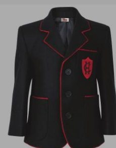
Chepstow House School blazer (pictured to the right)

A record rent for W11 in excess of £60 per sq ft has been offered by Alpha Plus, the private educational group, for the 30,000 sq ft Isaac Newton Centre on Lancaster Road, W11. It will be the new home for Chepstow House School. The ex-Royal Borough of Kensington & Chelsea training centre occupies a site of around 1.5 acres and was offered to the market with the existing D1 educational use. The Council received considerable interest from local schools and educational organisations demonstrating the shortage of this type of stock in one of London's most affluent Boroughs. The Alpha Group run some of the capital's most expensive private schools such as Wetherby School, where Princes William and Harry were former pupils.