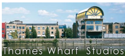
Thames Wharf Studios

The 1st quarter of 2014 has been a substantial growth quarter with both office rents and residential prices higher than the values before the 'Northern Rock bank run' of September 14th 2007. Office supply is down as are investment yields, whilst demand is up.